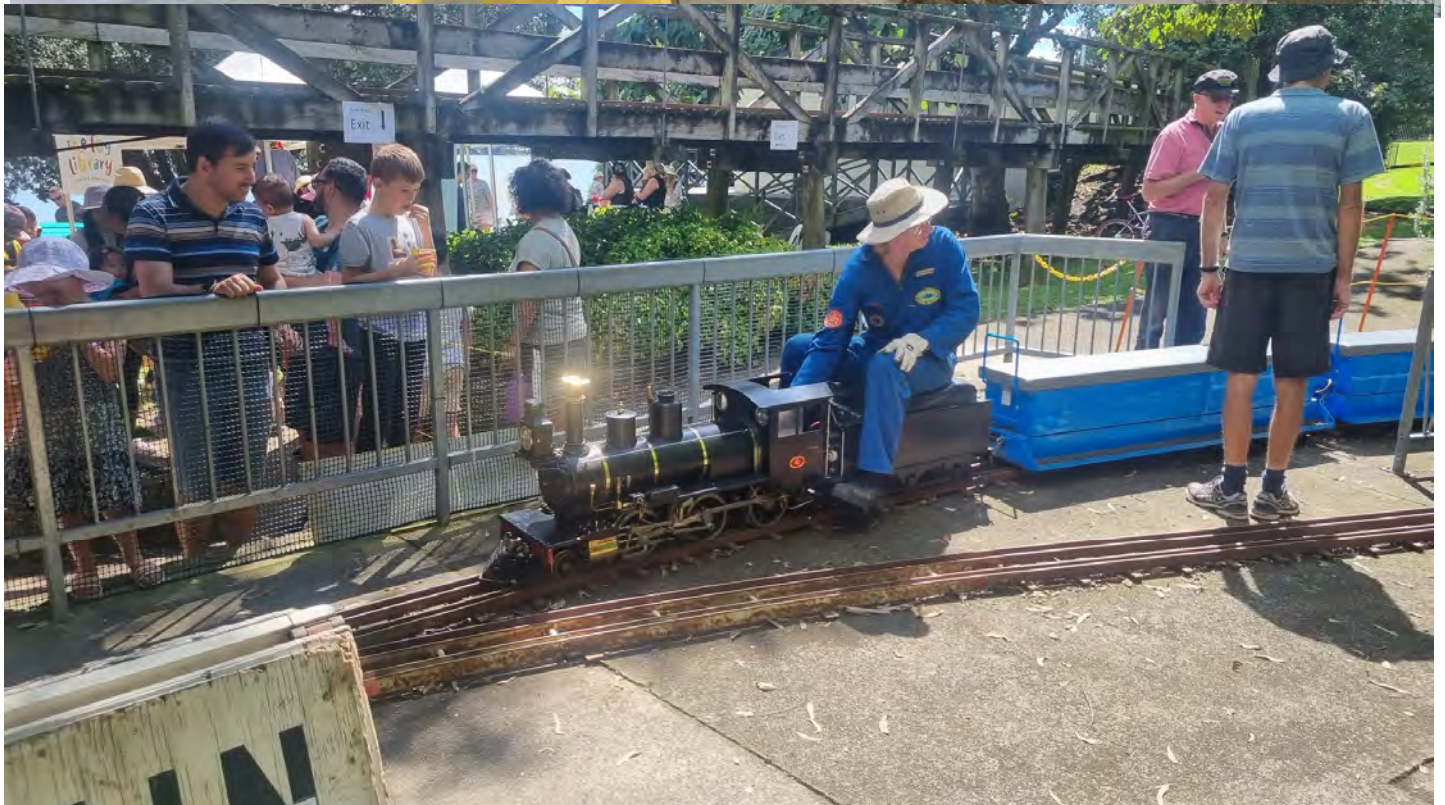
All pictures of the Panmure Basin Festival , including the cover, taken and provided by Dave Housley