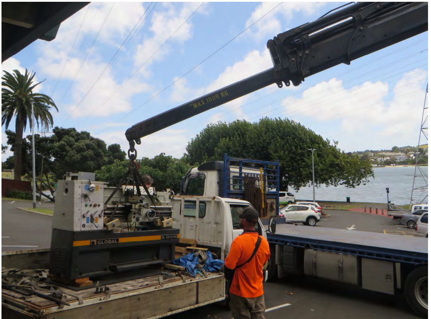
ASME Lathe Arrives at Waipuna