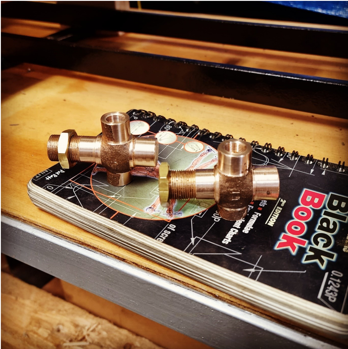
Chucking piece to take off and then start on the pump rods eccentrics and split yokes